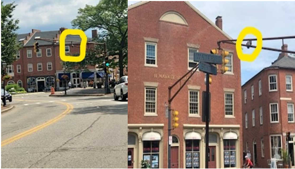
Figure 2- Traffic Cameras Identified by Witness #2