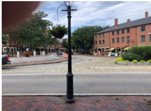
Figure 1-Witness #1 View of Incident