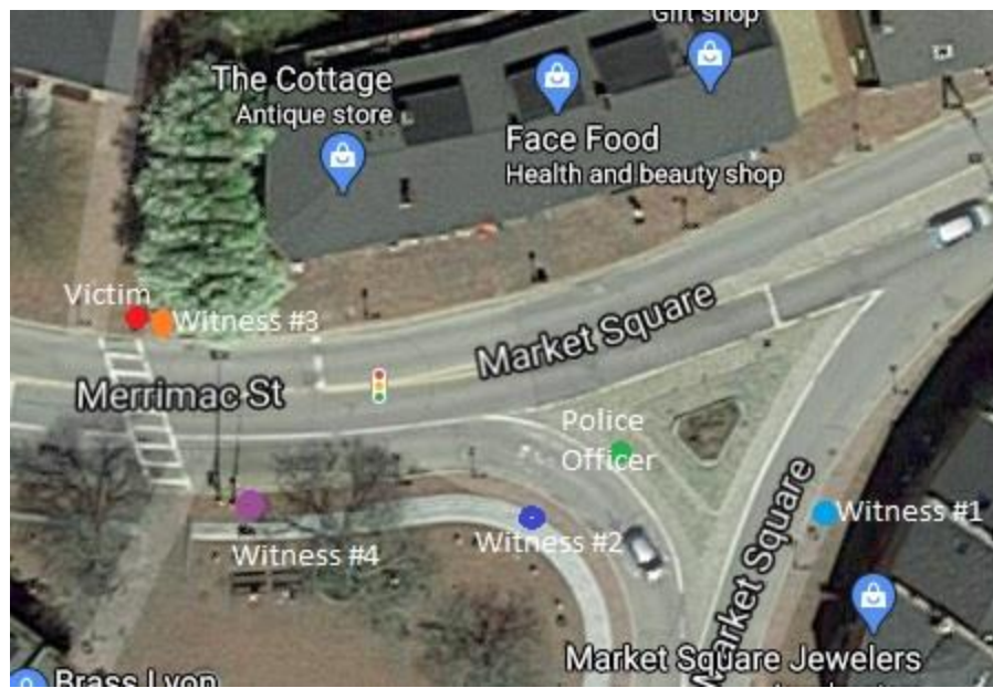
Figure 7 - Overview of the location of the witnesses